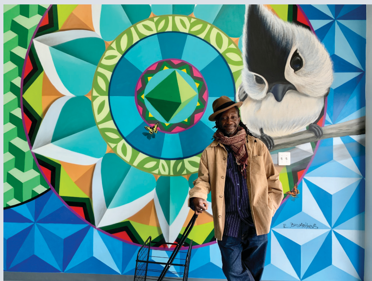
The colors of Ricks’s mural echo those of the ALIVE! logo.