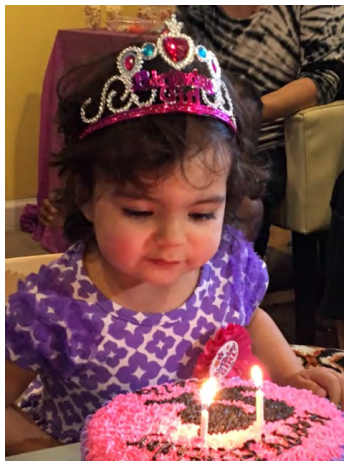
An ExtraOrdinary Birthdays party at ALIVE! House.