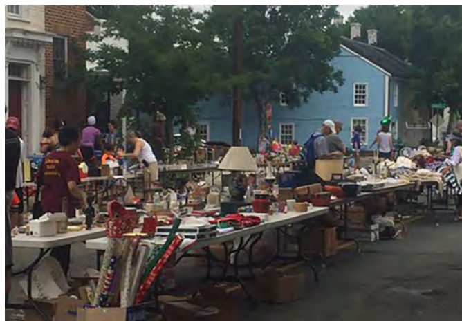
South Payne Street was turned into a market for the 2017 Sidewalk Sale.

Volunteers from New Life Christian Church assembled new furniture and took a break from the renovation projects for a quick photo opp.