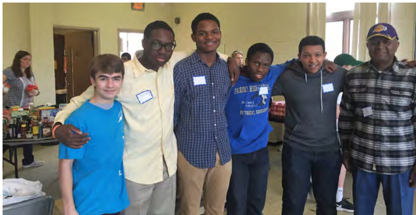
Volunteers from T.C. Williams High School at February's Last Saturday Food Distribution

Alexandria County Day School Blessed Sacrament Youth Group Bishop Ireton Bishop O'Connell Boy Scout Troop 129 Brownie Troop 2602 Capitals Academy Crew 129 Episcopal High School Girl Scout Troop 4737 The Madeira School T.C. Williams High School