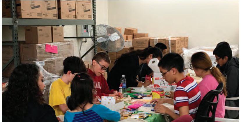
Volunteer Alexandria's Youth Volunteer Connection Program gathered at the expanded ALIVE! Alexandria Food Center on Saturday, October 31st to learn about the food programs of ALIVE! and decorate canvas bags for the clients of ALIVE!'s weekly food deliveries.

If you want to join ALIVE! and the ACPS in helping these students to be able to literally focus on a pathway to a better, more productive life, then please consider sending a donation to ALIVE! earmarked for Smiles for Our Students (SOS) on the check memo line.