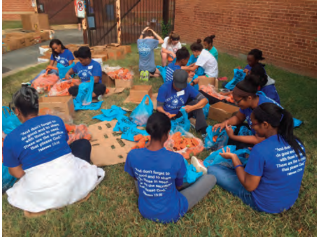
Once again, an amazing collaboration transpired in September with Alfred Street Baptist Church and ALIVE! to Feed the 5,000.