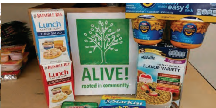
Examples of 'kid friendly' food needed for Weekend Care Bags