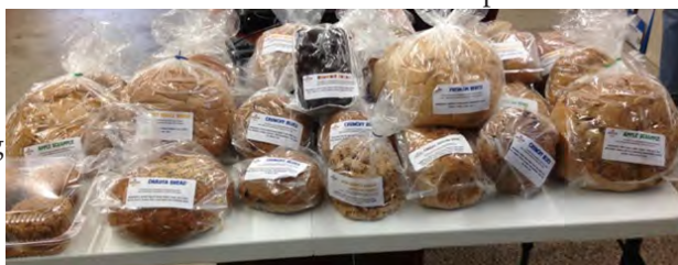
Many thanks to Great Harvest Bread of Alexandria for their generous donation to ALIVE!'s Food Program

In another new partnership with a local business, Great Harvest Bread Company in Alexandria has started a regular donation of bread to ALIVE! Their first donation — 122 pounds!! — was an outstanding contribution, and they have promised weekly support to ALIVE!'s food assistance efforts.