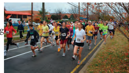
Above: Turkey Trot runners take off at the starting line.

exciting ALIVE! tradition. The event, brought to you by the DC Road Runners Club and the Del Ray Business Association, will start at 9:00 AM. Runners will support ALIVE! by bringing non-perishable food to donate. Volunteers who are not running may participate by collecting, sorting, and packing the donations for delivery to our food warehouse. The Turkey Trot is a great experience for the whole family, and your help is needed. Registration details are available online at http://www.alexandriaturkeytrot.com .