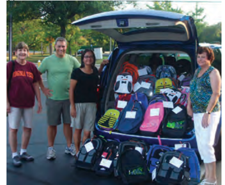
Above: Loaded up with over 100 backpacks, the new van is ready to go to Cora Kelly for the distribution.

Later this Spring, we submitted a proposal to Poor Robert's Charities, a DC-based 501(c)3 non-profit that for many years has provided vans to other charities who work