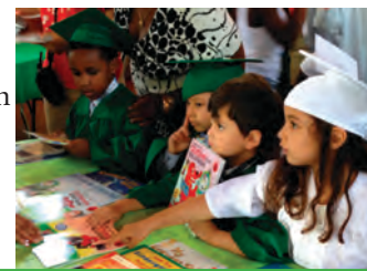
Right: Children excitedly select new books to take with them in honor of their graduation.