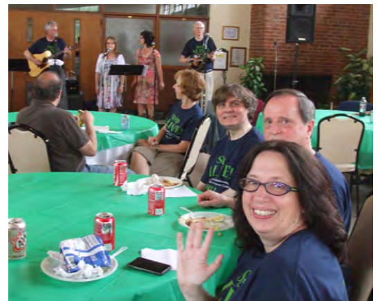
Walkers enjoy the music during the picnic