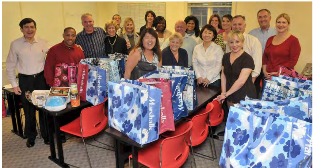
Keller Williams Realty associates, family and friends are shown with some of the bags used to deliver a Thanksgiving turkey with all the “fixins” to Alexandrians in need.

What better way to show our thanks for all our blessings!