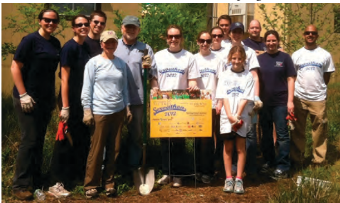
Some of the FMP volunteers who have volunteered for ALIVE! Programs.