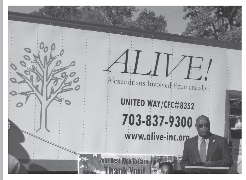
Mayor Euille addressing crowd at UW Campaign Kick-off.

Make a real difference in the Alexandria Community by designating ALIVE! # 8352 as your UW/CFC campaign agency choice.