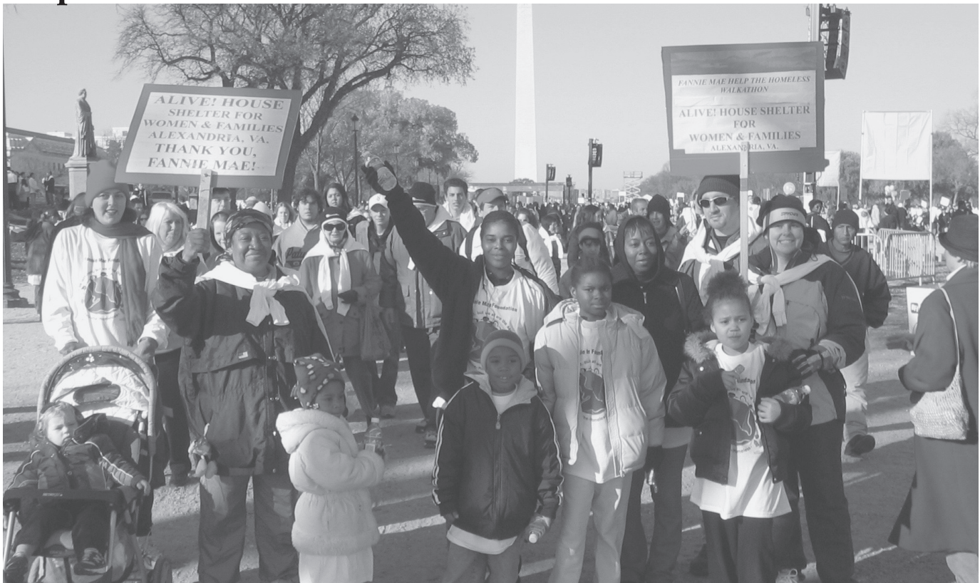
Beautiful Day! Beautiful People! having fun supporting ALIVE! House in the 2005 Help the Homeless Walkathon on the National Mall on November 19th. Many other friends were scattered throughout the crowd. Thank you Walkers and Sponsors. Details of campaign in next WIRE.