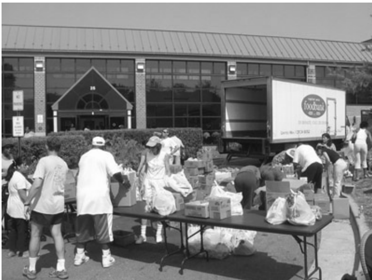
LSFD volunteers sort and hand out food to recipients at Cora Kelly site on June 25.

Around 4:00 p.m. on Saturday, May 14, approximately 30 volunteers eagerly awaited the first delivery of food from the Annual National Letter Carrier Food Drive. Neither they nor ALIVE! was disappointed. All in all, three post office delivery trucks pulled up with food donated by the Alexandria community. One by one the cartons of food were unloaded, sorted, boxed, and stored. Even a severe thunderstorm with torrential rain and momentary hail did not deter the volunteers – or the postal workers – from the task at hand. Final results: approximately 130 banana boxes of food were filled and stored. This translates to 6,000 – 7,800 pounds of food! Whew! ALIVE! extends its deep appreciation to everyone in Alexandria who donated food. ALIVE! also thanks all the volunteers who helped out to make this event a success!