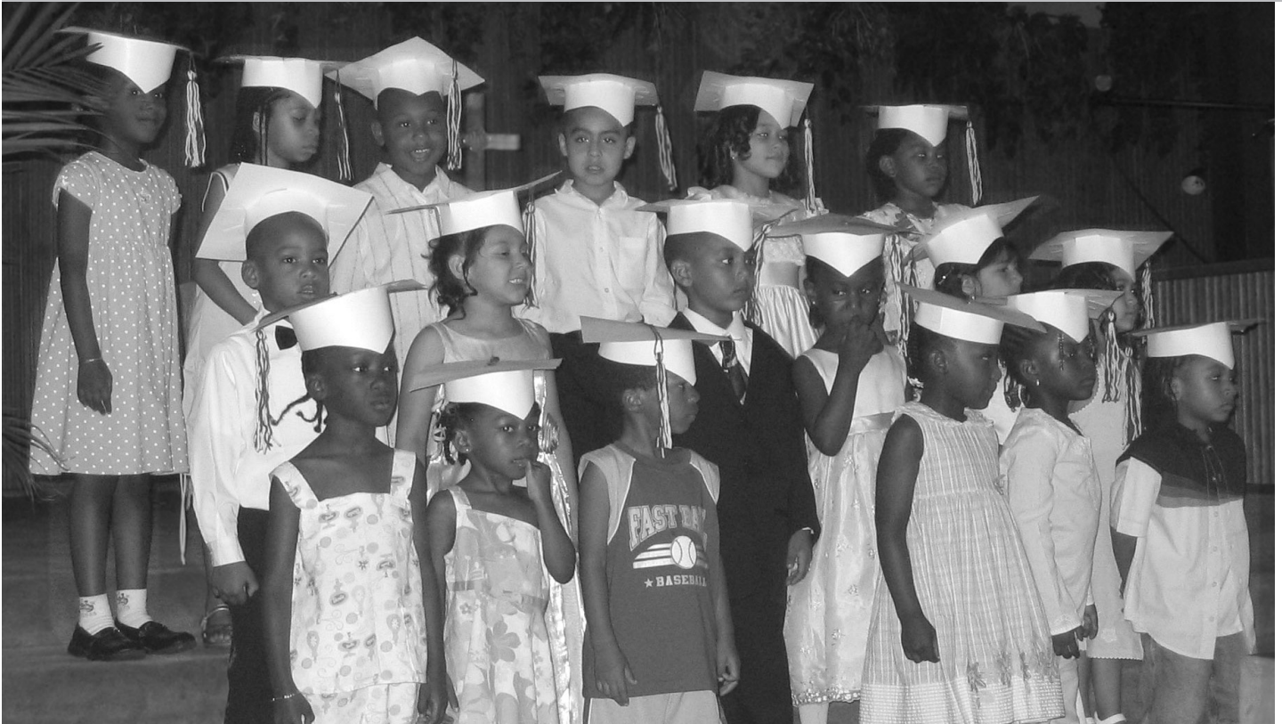
CDC class of '05 photographed at their June 17 graduation ceremony