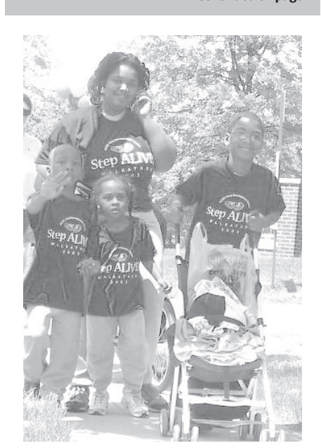
The Step ALIVE! Walkathon ... a Family Affair