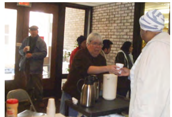
Resurrection church volunteers offer coffee to waiting clients.