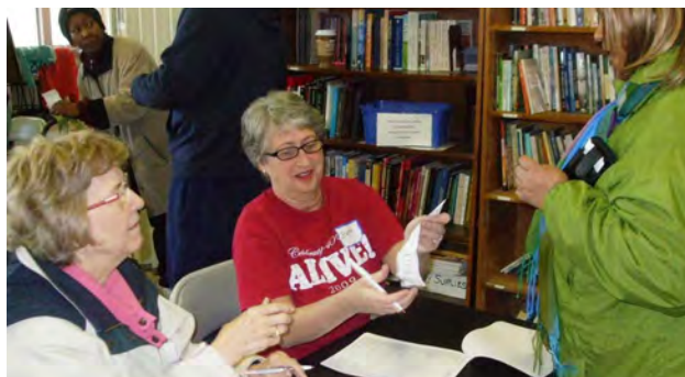
Resurrection volunteers check in the clients.